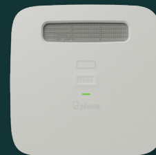
any space PL1AS